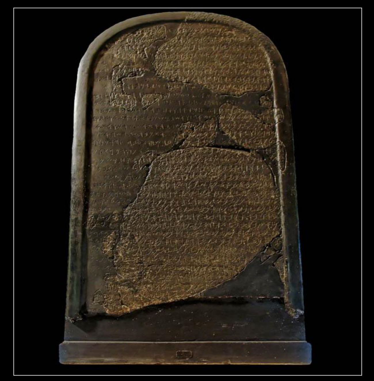
Mesha Stele, also called the Moabite Stone, circa 820 BC