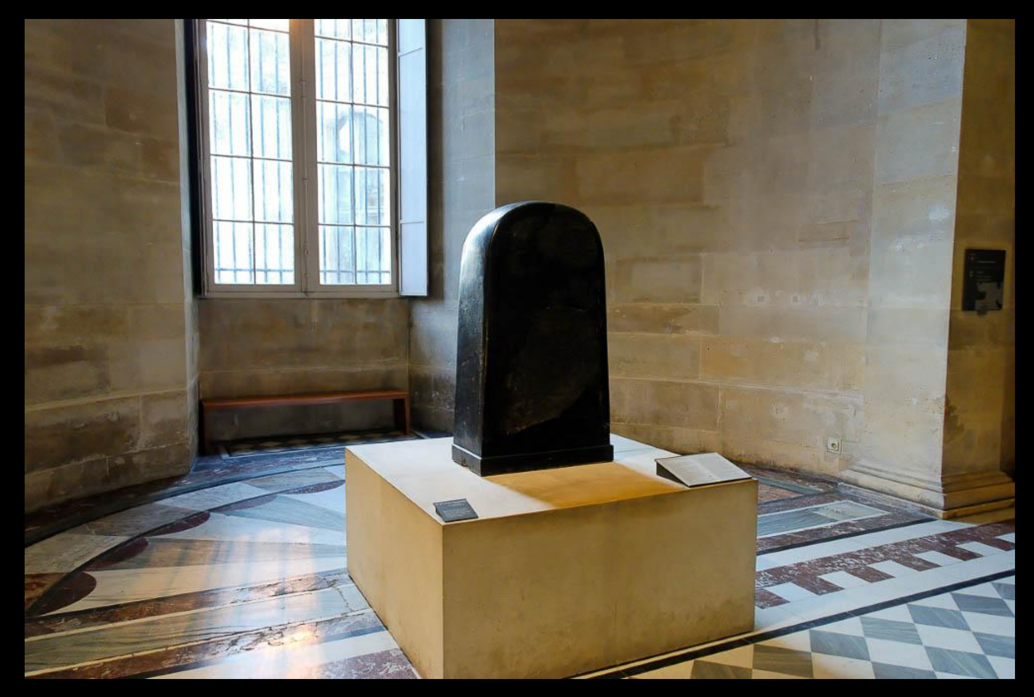
Mesha Stele, also called the Moabite Stone, circa 820 BC